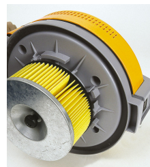
Optional filters available for dry operation