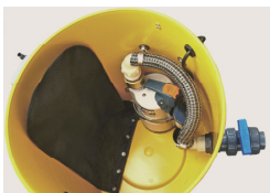
Quality waste pump and debris filter bag built into unit

Options: Dry Filter, Brush Tool, Carpet Tool, cartridge filter, HEPA filter, paper bags.