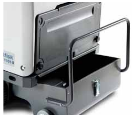
The hopper capacity is extremely large to extend operational time