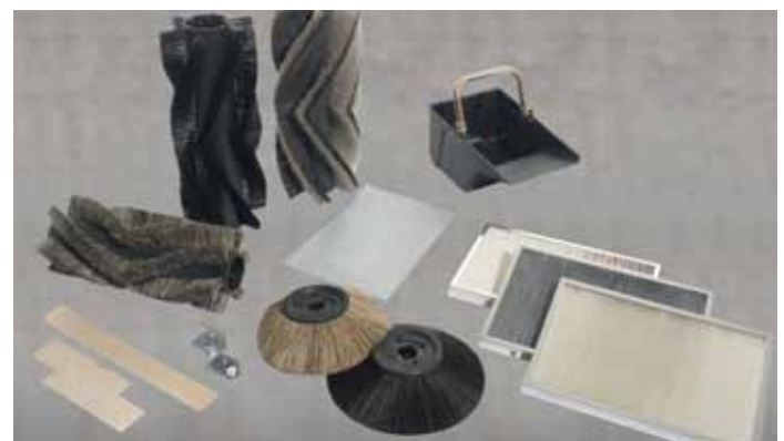
Large range of optional accessories provides the right tools for specific jobs e.g. carpet kit, special filters and brushes, overhead guard, 2x18 litres hopper containers etc.