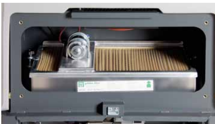
An electrical filter shaking system cleans the filter automatically every 5 minutes