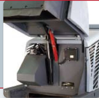
A unique safety block system for the hopper can be activated by the operator from the seating position