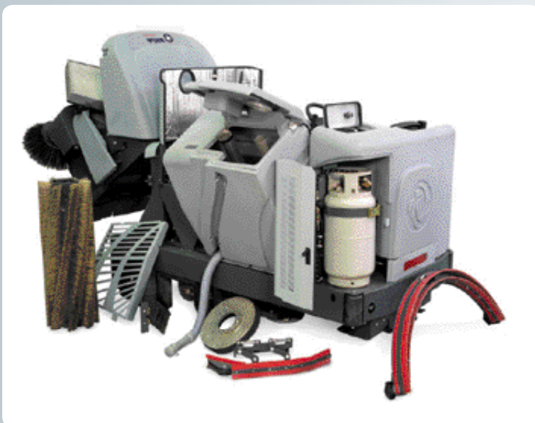
No tools needed in order to access key components. Maintenance is fast and simple