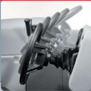
Adjustable steering wheel position provides optimal operator comfort and improved safety.