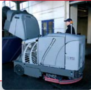
The hopper is easily emptied without restricting the operator's visibility thanks to its smart off-set design