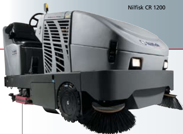
Nilfisk CR 1200

Nothing is left to chance. All models are available as diesel, petrol or LPG with the CR 1100 and CR 1200 also having battery variants to meet the specific cleaning applications. The tank capacity is larger than any other comparable machine, providing longer running time, higher productivity and lower cleaning costs. Operator comfort is at an all-time high, thereby reducing fatigue and increasing safety and performance. Maintenance has never been easier thanks to the 'no tools' service access points.