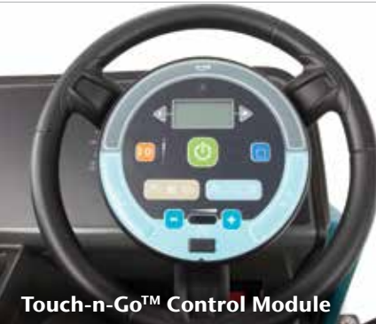
Touch-n-Go™ Control Module

▶ Touch-n-Go™ control module with 1-Step™ start button allows operators quick access to all settings without removing hands from the steering wheel.