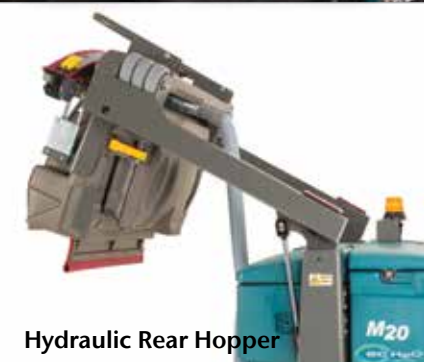
Hydraulic Rear Hopper