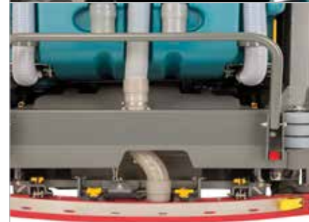
Yellow Maintenance Touch Points