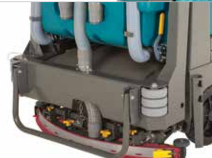
Dura-Track™ Parabolic Squeegee

Overhead guard protects operators from falling objects.