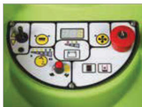
INTUITIVE CONTROL PANEL