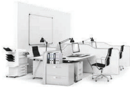
BUILDING SERVICE CONTRACTORS